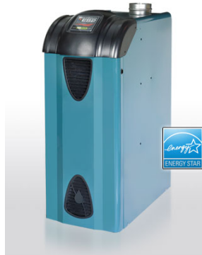
ES2 Cast Iron Boiler

Behrmann Company sales engineers are available to assist you with more information, selection and sizing advice. Give us a call.