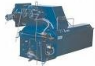
AC Series, 420-19,100 MBH, air atomized light oil and gas, Regular & HTD, Low NOx capable

Adding low NOx to the burner makes it more environmentally friendly and is a green step. Adding linkageless controls enables burners to maintain a precise air/fuel ratio throughout their firing range to minimize combustion air, lower fuel consumption and increase efficiency, and it is a green step.