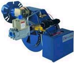
X4 Series, 35-700 MBH Gas only, regular & HTD

Power Flame has been the market share leader in forced draft gas, oil and gas/oil burners for many years, but now their share will grow dramatically due to a competitor discontinuing operations. No other manufacturer offers the breadth of line that Power Flame does, and most models are offered in optional Low NOx, HTD high turndown and linkageless configurations. Here is a reminder of the burners Power Flame offers: