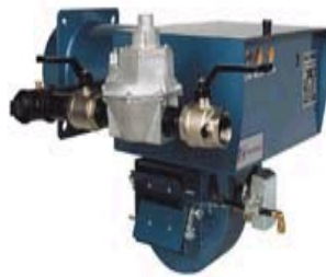
J Series, 300-2200 MBH Gas only, regular & HTD