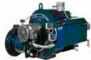
Cmax Series, 1,260-64,600 MBH Gas,oil,gas/oil, regular & HTD, Low NOx capable