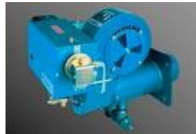
Nova Premix, 400-2,200 MBH, gas only, affordable Low NOx without flue gas recirculation