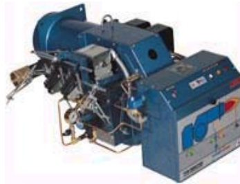
C Series, 98-19,100 MBH Gas,oil, gas/oil, regular & HTD, Low NOx capable